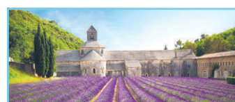
8 Day Flavours of Burgundy & Provence July & August 2020 Lyon to Lyon

Staterooms from £1,870 pp Balcony Suites from £2,520 pp