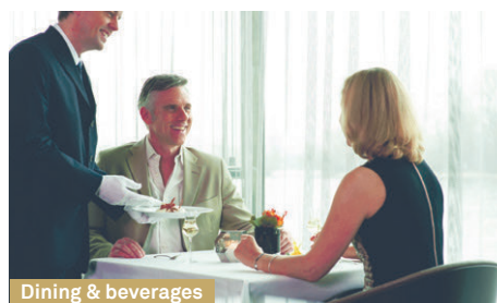
Dining & beverages

What are you waiting for? See why at Scenic we set the bar for luxury river cruising, and why we elevate your experience to the next level to take you on a journey that's truly exceptional, incomparable, and all-inclusive.