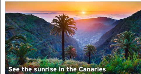
See the sunrise in the Canaries

Cruising from the UK isn't just a summer thing. This year, P&O Cruises has a 14-night cruise from £999 leaving Southampton on December 22 to head for the Canaries – Lanzarote, Gran Canaria, Tenerife – and Madeira. It's on family-friendly ship Oceana , which has 14 Southampton sailings between October 10 and April 9, including a 35-night jaunt to the Caribbean and back that takes in a stretch of the Panama Canal. From a tempting £1,499, departing on November 17 (0344 338 8003/pocruises.com)