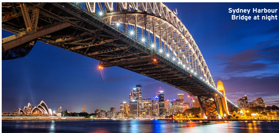
Sydney Harbour Bridge at night

buffets, lavish lunches, multi-course dinners – even afternoon tea – are served in the modern Waterfront restaurant. There's also the Caribbean-style Plantation Bistro, the Alfresco Grill, the Grill steakhouse and the Asian-cuisine Fusion. Inside and outside bars include the Dome Observatory.