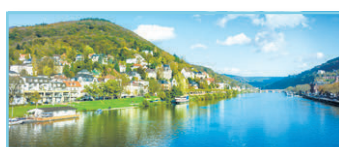
8 Day Jewels of the Rhine May - October 2020 Amsterdam to Basel

Staterooms from £1,320 pp Balcony Suites from £1,970 pp