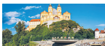
8 Day Danube Explorer June - August 2020 Passau to Budapest

Staterooms from £1,770 pp Balcony Suites from £2,420 pp