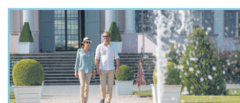
8 Day Danube Delights April - November 2020 Nuremberg to Budapest

Staterooms from £1,320 pp Balcony Suites from £1,970 pp