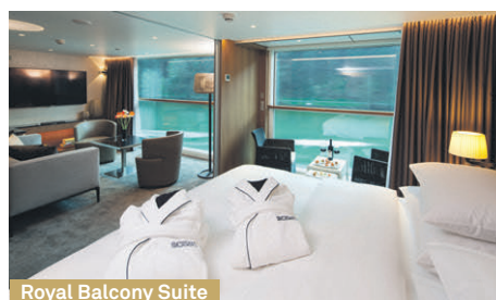
Royal Balcony Suite