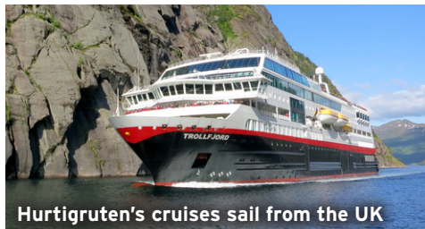
Hurtigruten's cruises sail from the UK

As a shipping line, Hurtigruten has served as part-cruise company, part-essential transport and part-mailman for 126 years. Now, for the first time, Hurtigruten will sail from the UK, with the North Cape cruise hugging the coast of Norway up to Europe's northernmost tip. The MS Maud – transformed with hybrid propulsion to a high-class expedition ship – departs from Dover from October 2021 on. From £3,299, the 14-day cruises reach Honningsvåg, Norway's northernmost city, and include daily on-shore activities (02031 315030/hurtigruten.co.uk)